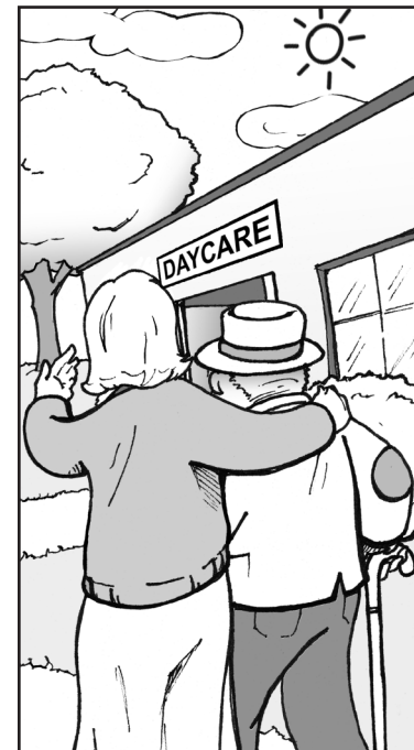
Adapted from The Comfort of Home: Caregiver Series, © 2018 CareTrust Publications, www.comfortofhome.com